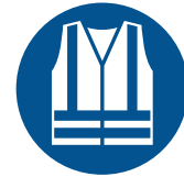
HIGH VISIBILITY CLOTHING