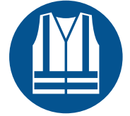
WEAR HIGH VISIBILITY CLOTHING IN MULTI-VEHICLE AREAS