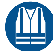
WEAR HIGH VISIBILITY CLOTHING IN MULTI-VEHICLE AREAS