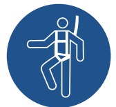
FALL ARREST HARNESS