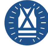
HIGH VISIBILITY CLOTHING