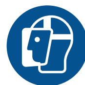
EYE & FACE PROTECTION