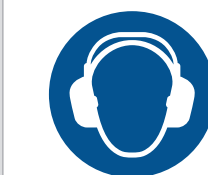
HEARING PROTECTION LOUD NOISE CLASS V PROTECTION REQUIRED